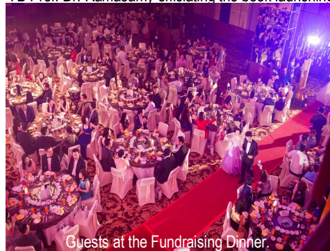
Guests at the Fundraising Dinner.

BOLD, together with ACS, held a highly successful fundraising dinner on 23 August at Wembley St. Giles. Generous donors and supporters filled 60 tables and enjoyed a most entertaining programme based on the theme Dazzle and Dance.