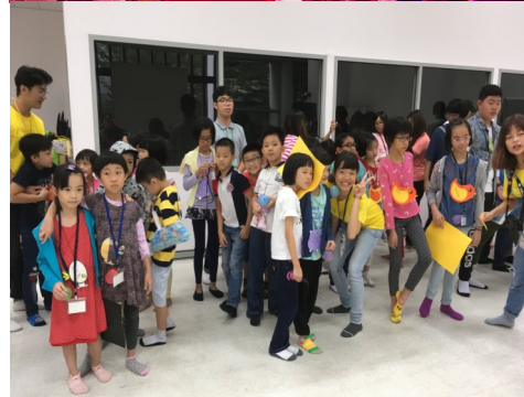
Siblings of children with special needs at camp.