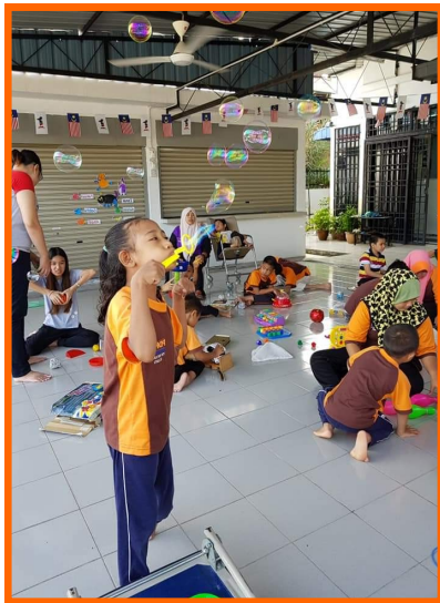
Blowing bubbles helps improve coordination of hand muscles.