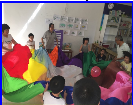
Fun time during the camp-bouncing a balloon in a parachute.