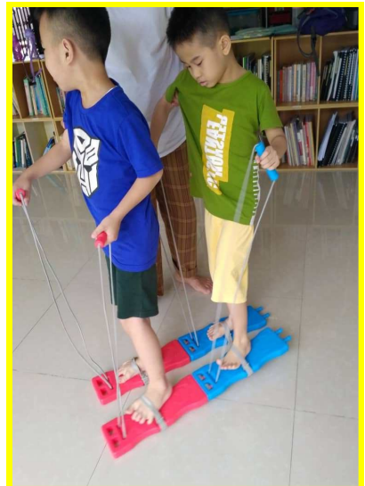
Children working in pairs at a Social Group session.