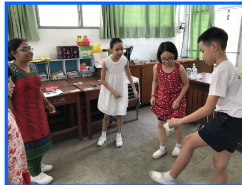
Supportive peers facilitate inclusion.

Support for Inclusive Education continued in 2018 where our staff provided consultancy and screening support to 3 primary schools and 8 pre-schools. Support was provided through 25 on-site visits and regular phone consultation with teachers. In August, BOLD officially launched the "We Are Friends" series, a set of children's books for fostering peer support and understanding of children with special needs in inclusive educational settings.