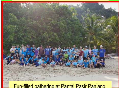
Fun-filled gathering at Pantai Pasir Panjang, Balik Pulau.

WORLD PLAY DAY is celebrated annually by children around the world. It is to raise awareness that playing with children is an important tool for a child's development. In 2019, Pantai Pasir Panjang in Balik Pulau was chosen to celebrate the day. A total of 30 children participated with their parents, assisted by staff and volunteers.