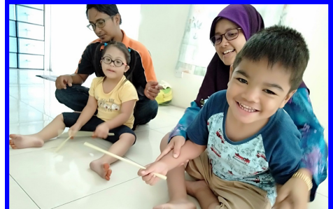
Parents involvement, an important bonding process that enhances the development of children.

focuses on children with developmental delay from birth to 4 years old. At First Step, working 'one-to-one' with young children and their care-givers is essential to meet the child's specific needs. Small groups for older children is also available to prepare for inclusion into pre-school. In 2019, 44 children benefitted from this programme at First Step in Gelugor while 49 benefitted at First Step in Seberang Jaya.