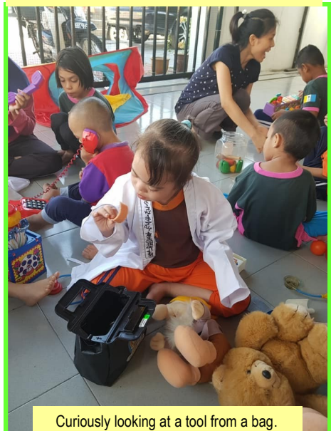
Curiously looking at a tool from a bag.

JOM TOY LIBRARY continued to bring the joys and pleasures of play to children in the rural areas. In 2019, JOM made consistent visits to 4 programmes Pemulihan Dalam Komuniti namely Paya Keladi, Pinang Tunggal, Sungai Batu and Kuala Juru benefitting a total of 60 persons. Jom Toy Library offers a variety of play materials to develop children with special needs growth.