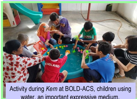
Activity during Kem at BOLD-ACS, children using water, an important expressive medium.