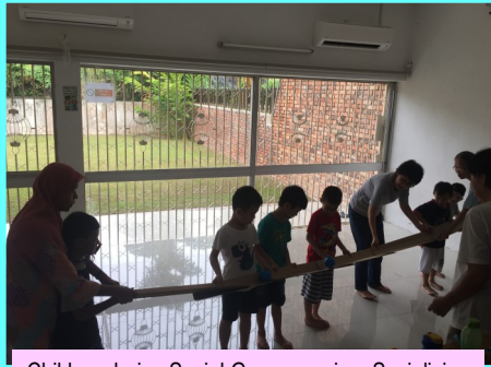
Children during Social Group session. Socializing with others is crucial to improve their skills.