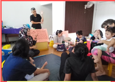
First time Respite at ACS-Seberang! Children with Respite team members.

RESPITE offers a short term care courses to parents/guardians who have children with special needs. Having 'me time' for parents/guardians is crucial to help lower decrease their stress level. At Respite, from 29 to 31 of May, 11 staff and volunteers supported 5 children with mobility disorders. Meanwhile in November 5 more children enjoyed interactive games and activities and bonded with their carers.