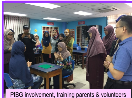
PIBG involvement, training parents & volunteers at SK Sungai Gelugor.

PLAY GROUP , an intervention programme for 3-5 year olds with developmental delays/disorders in the areas of social, communication and language skills, is conducted weekly on Saturday afternoons. A total of 26 children enjoyed fun-filled play activities of various action songs and indoor games. SOCIAL GROUP targets children from ages 6 to 8 years. Activities were designed to increase their socialization and learning skills so as to help focus and stay on a task. Nine children benefitted from the weekly sessions on Wednesday afternoons.