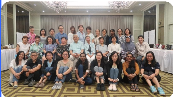
Committee Members (seated on chair) accompanied by staff & team members