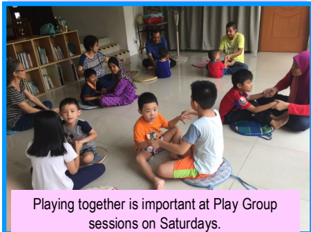
Playing together is important at Play Group sessions on Saturdays.